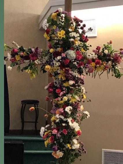
Flowering the Cross and Easter Baptisms