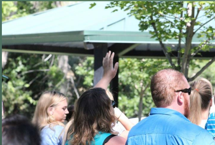
Worship in the Park